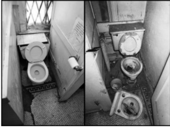
The WRL bathroom in 2016 (left) versus 1969 (right).